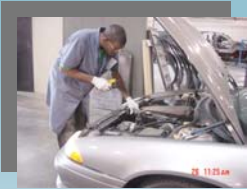
Greenville Tech Automotive Center Technician performing under-the-hood inspection

Do your part to SPARE THE AIR! It all adds up to cleaner air in Greenville County